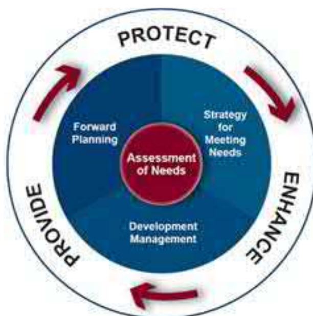
Figure 1: Sport England planning objectives - Protect, Enhance and Provide

To provide new playing pitches where there is current or future demand to do so