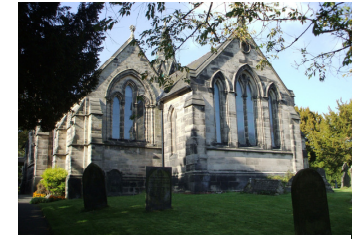
Landmark 10- St Michael's