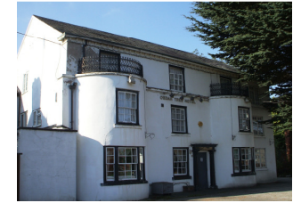
Landmark 9- Cedar Tree Hotel