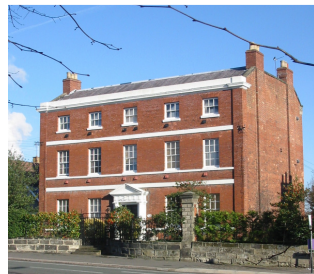
Landmark 14- Brereton House