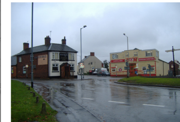
Gateway and Landmark 6- Five Ways Island

Based on Ordnance Survey Mapping with the Permission of the controller of her Majesty's Stationary Office © Crown Copyright. Unauthorised reproduction infringes Crown Copyright and may lead to prosecution or civil proceedings. Cannock Chase District Council. Licence No. 100019754. 2010