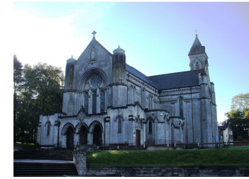
Landmark 7 – Our Lady of Lourdes