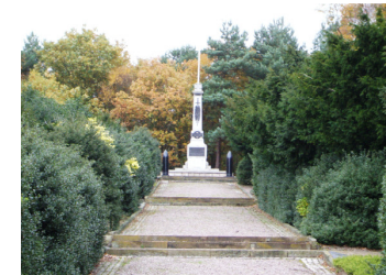
Landmark 8 – War Memorial