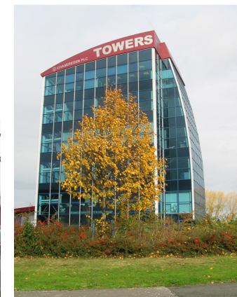
Landmark 16- Towers Point

Based on Ordnance Survey Mapping with the Permission of the controller of her Majesty's Stationary Office © Crown Copyright. Unauthorised reproduction infringes Crown Copyright and may lead to prosecution or civil proceedings. Cannock Chase District Council. Licence No. 100019754. 2010