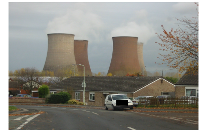
Landmark 11- Rugeley Power Station