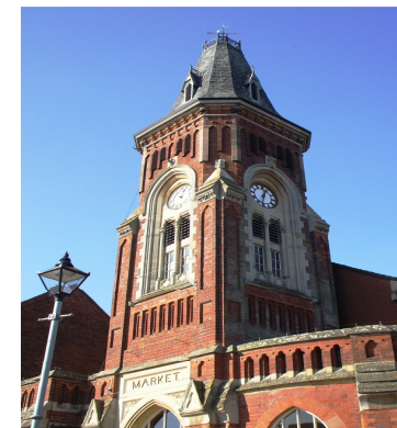
Landmark 12- Tower Clock and former Market Hall