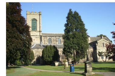
Landmark 13- St Augustine's