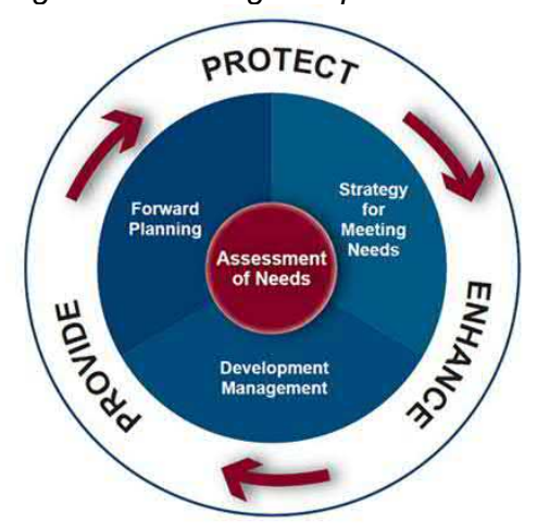
Figure 1: Planning for Sport model

As illustrated, Sport England regards an assessment of need as core to the planning for sporting provision. This report reviews indoor and built sporting facility need in Cannock Chase and provides a basis for future strategic planning.