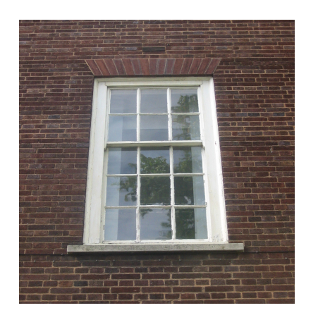
Fig. 1: Features typical of the Conservation Area vulnerable to removal and decay: timber windows, architectural details, historic shopfronts