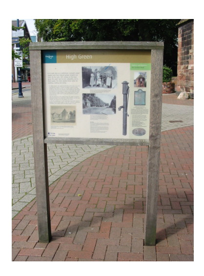
Fig.2: The public realm - well designed signage and paving, well located street furniture sited close to existing structures and poorly located utility cabinet 'clutter' standing alone