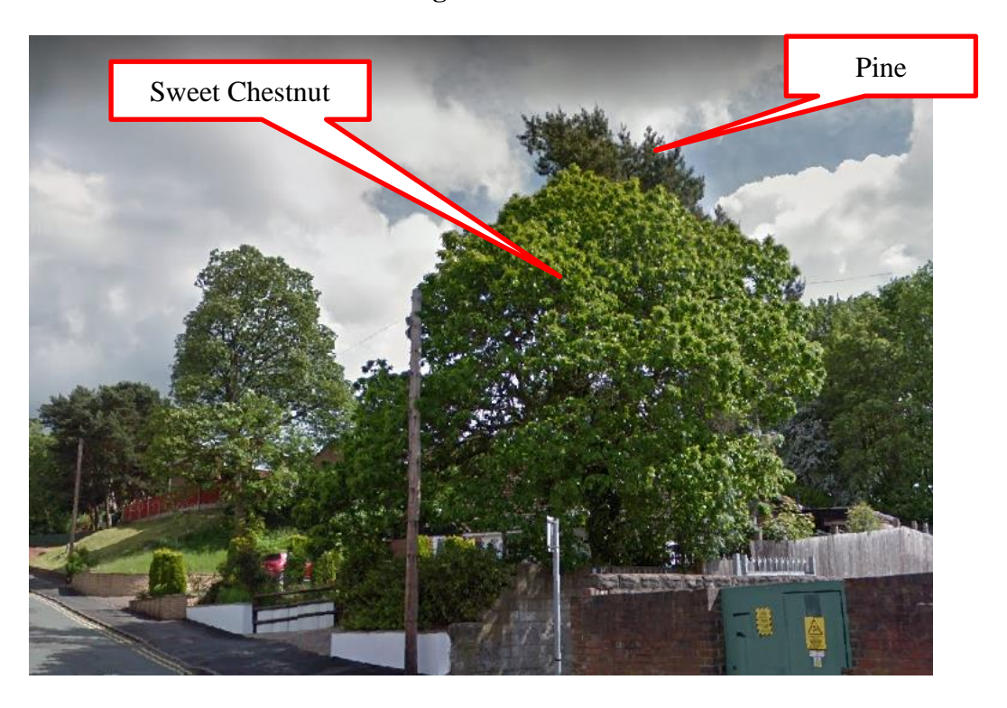
\label{eq:View from West-Source Google} \label{eq:View from West-Source Google} View from West-Source Google