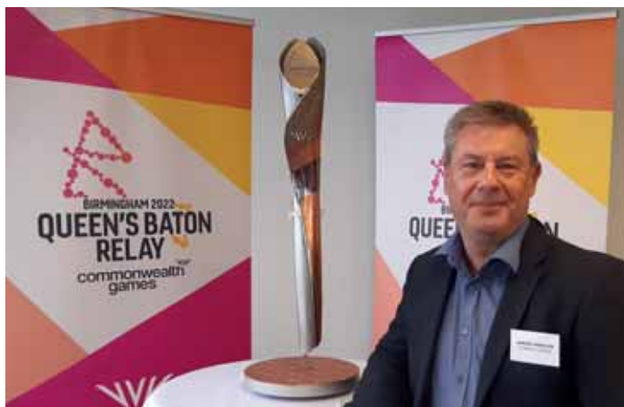
Admiring the Queen's Baton before its departure from Birmingham Airport.

The Council is working closely with its leisure and arts partner, IHL, on a diverse programme of activities, events, and volunteering opportunities for the Games and these will be published in the New Year. If your organisation (such as a school, parish, town council or community group or society), or yourself, would like to be involved in this local programme, please email communications@cannockchasedc.gov.uk to express your interest. Please provide your email address and state what channels of communication you use, which will help us promote the local programme to the wider community.