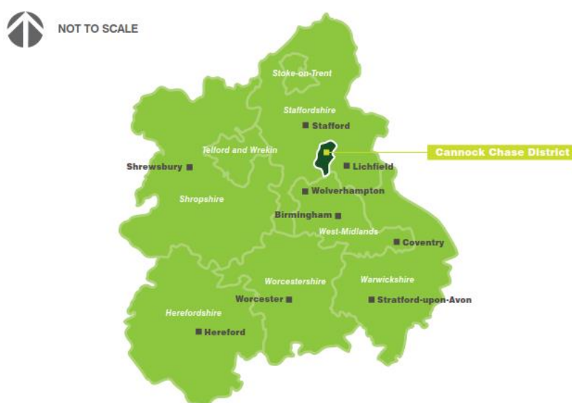
Figure 1: Location of Cannock Chase District in sub-regional setting

3.6 Figures 1 and 2 provide an overview of the geography of the District in its wider context.