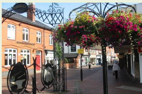
Rugeley Town Centre Conservation Area

Question 53. Do you have any other comments on our review of Policy CP15: Historic Environment?