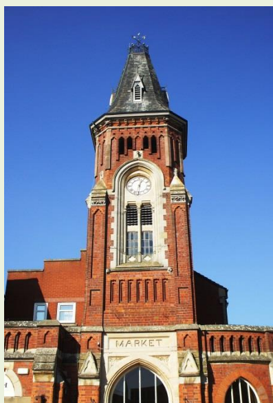
Clock Tower, Rugeley