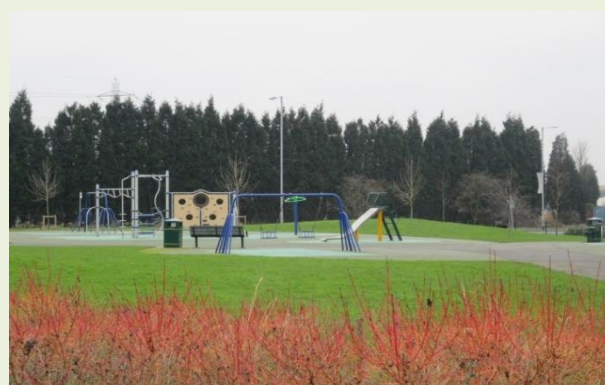
New Amenity & Play Space, Bridgtown