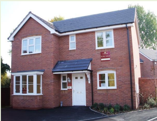
New House, Brereton

Question 29. Can you suggest specific criteria for screening out sites which are not reasonable options for development at an early stage? How might this be justified?