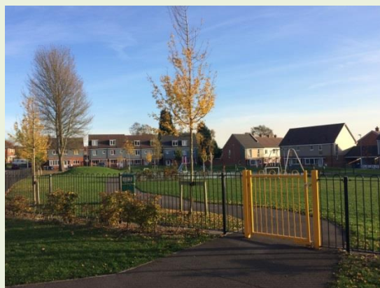
New Housing & Play Area, Cannock