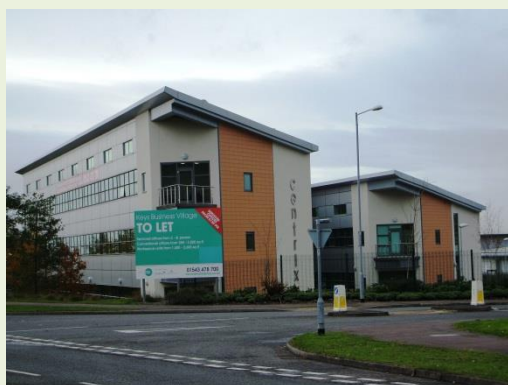
New offices, Hednesford

Question 40. Do you have any comments on the evidence base updates required, or the evidence and strategies of other organisations that need to be taken into account?