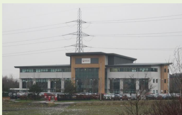
Modern Office Development, Cannock