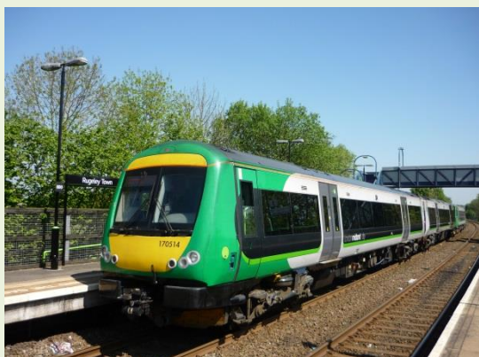
Train Station, Rugeley Town

Question 42. What evidence do we need to help us decide what options for growth are feasible, sustainable, realistic and deliverable? Is there already any up to date evidence which we can use to help us and if so, what?