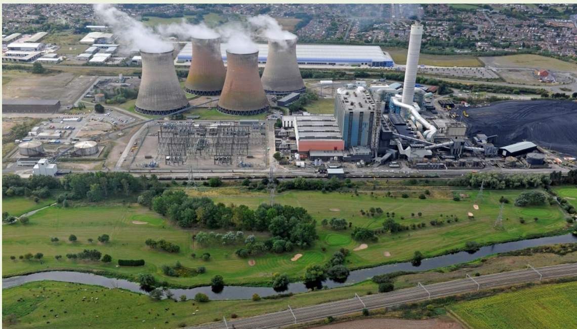
Rugeley Power Station

Question 38. Can you suggest specific criteria for screening out sites which are not reasonable options for development at an early stage? How might this be justified?