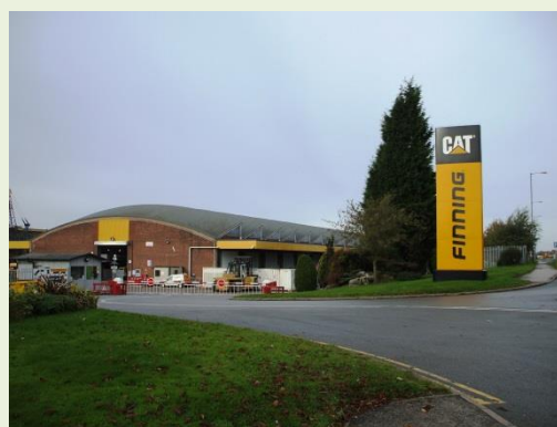
Local industry, Cannock