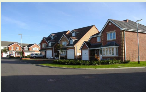
Modern Houses, Wimblebury

Question 18. Do you have any other comments on our review of Policy CP3: Design?