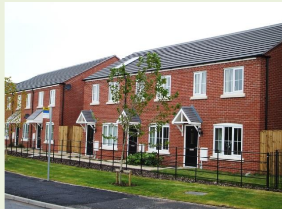
New Houses, Bridgtown