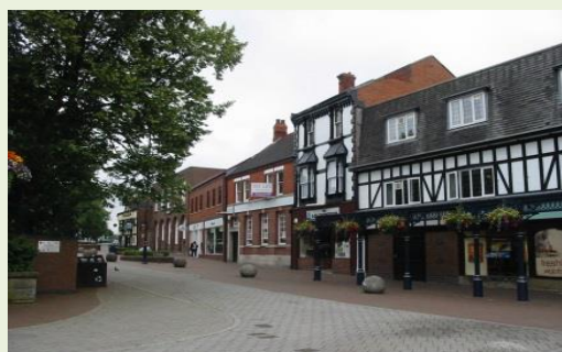
Cannock Town Centre Conservation Area