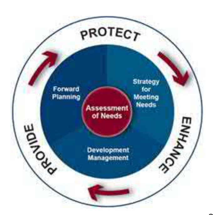
Figure 1: Sport England planning objectives - Protect, Enhance and Provide

To provide new playing pitches where there is current or future demand to do so