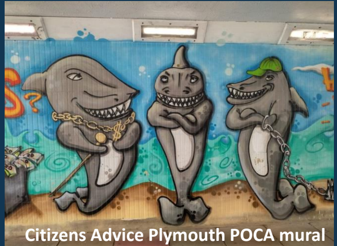
Citizens Advice Plymouth POCA mural

The Fund is made up of money seized from convicted loan sharks, which is made available to groups through a bidding process and grants are awarded to successful applicants.